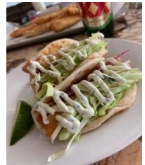
BAJA FISH TACO