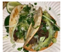
CARNE ASADA TACOS