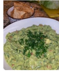
GUACAMOLE (family recipe)